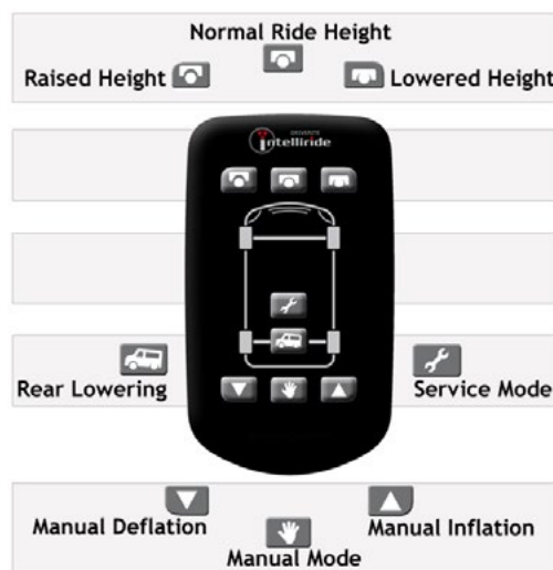
Handheld Controller The Drive-Rite Handheld

Please check our website for further information and latest details on this application.