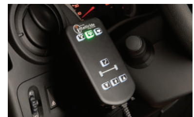
The Drive-Rite Handheld Controller